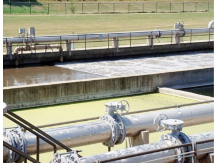
The City of Beloit Water Pollution Control Facility

In addition, an ABB DriveMonitor™ was selected for monitoring, controlling and remote diagnostics via a wall-mounted PC connected to the telephone line.